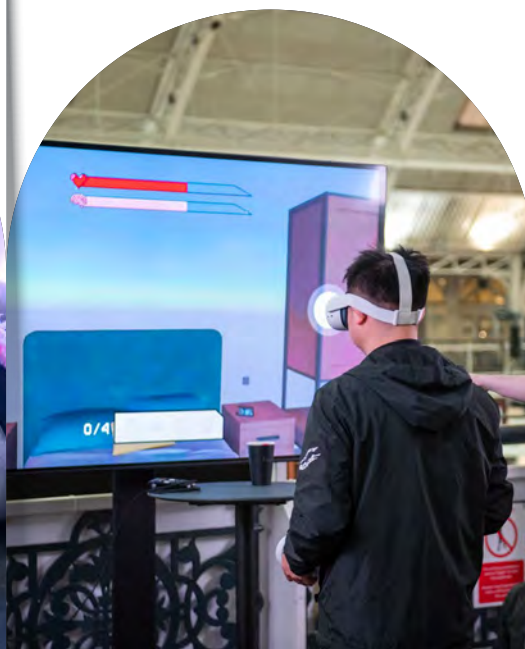
Sense of Space by Hoare Lea