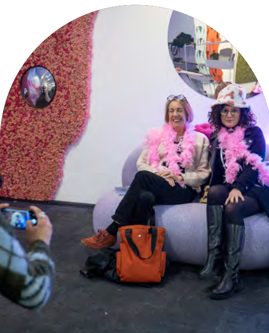
Mood Board Contest & Selfie Station by Peldon Rose