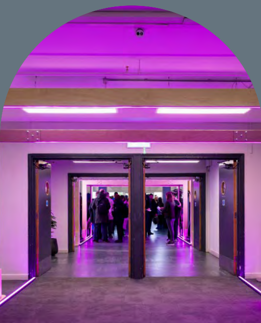
Entrance by Sheppard Robson