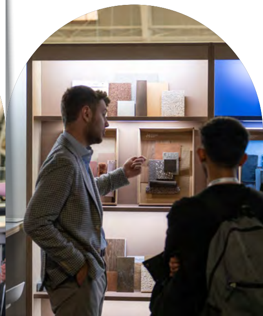
Material Bank Library