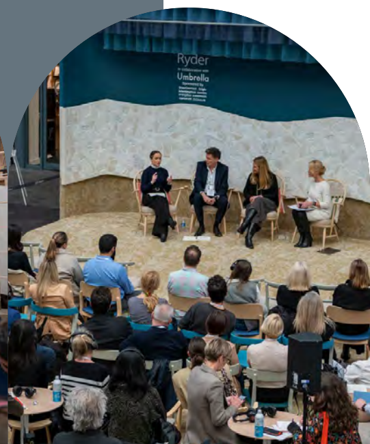
Insights Lounge by Ryder