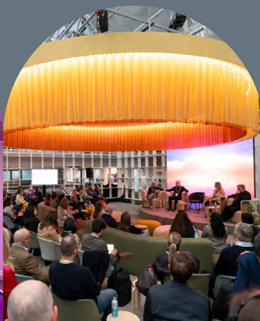
Design Talks Lounge by Gensler